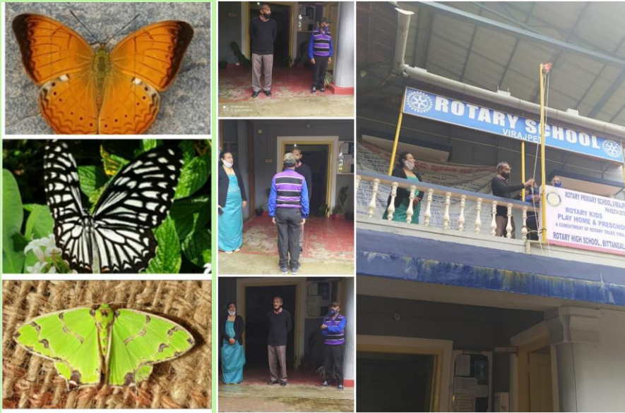
PHOTOGRAPHY ANN DEENA